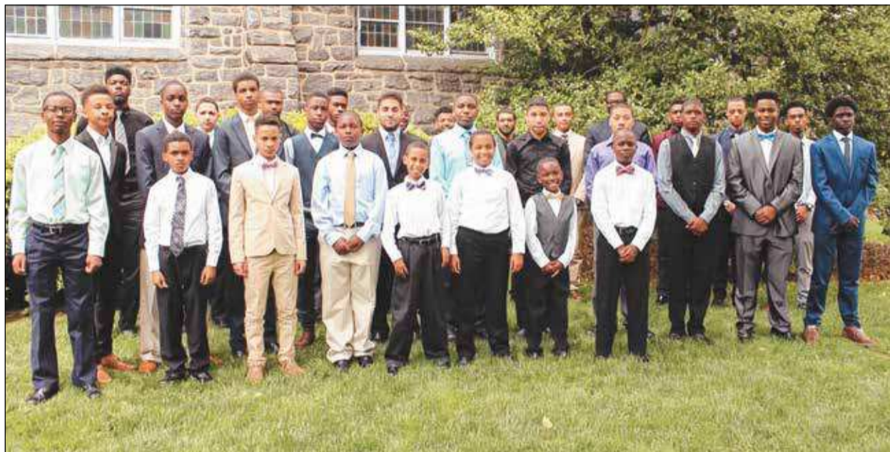
Dr. O. Wilson Winters Scholarship recipients and Paul Frost Memorial Book Awards recipients.